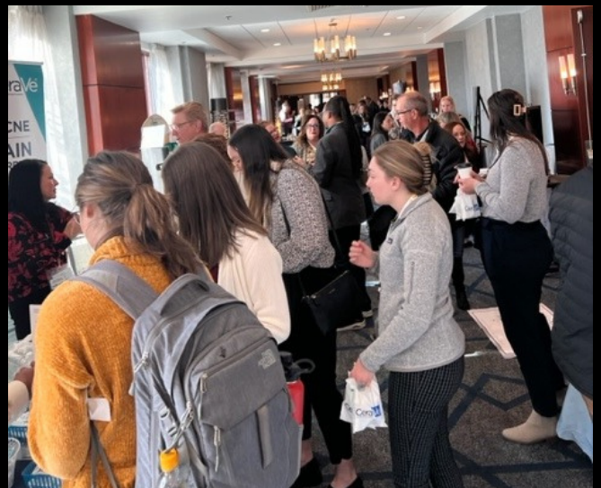
Exhibit Booth Price: $1200 Premium Exhibitor: $2000

Hotel group rate is available for exhibitors and sponsors.